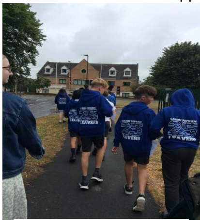
Year 6 - How is land use changing in Edenthorne?