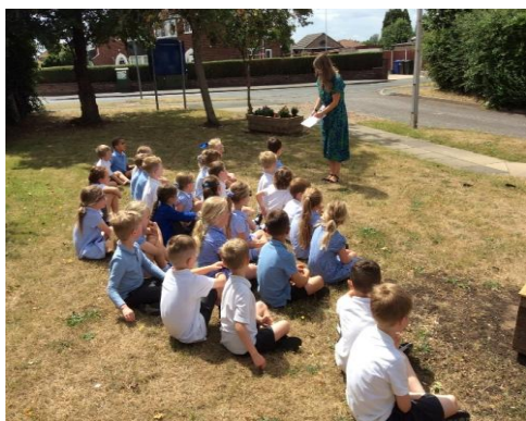
Year 1 – What are the features of Church Balk?