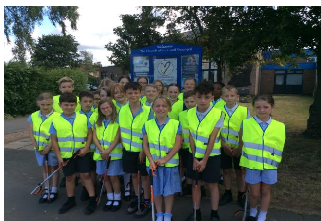
Year 4 - Does Church Balk need more bins?