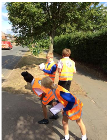
Year 5 - Does Church Balk need a zebra crossing?

This week, our pupils have been out and about in our school grounds or local area, developing their field work skills of observation, data collection, map reading and analysis, as well as a deeper understanding of their environment. Each class were given a real-life enquiry question to investigate and then collected data as evidence to support their observations and conclusions.